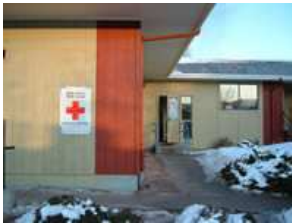
Red Cross Shelter opened at Springs of Life Church