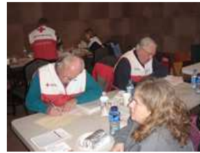
Red Cross volunteer caseworkers assist residents with emergency needs